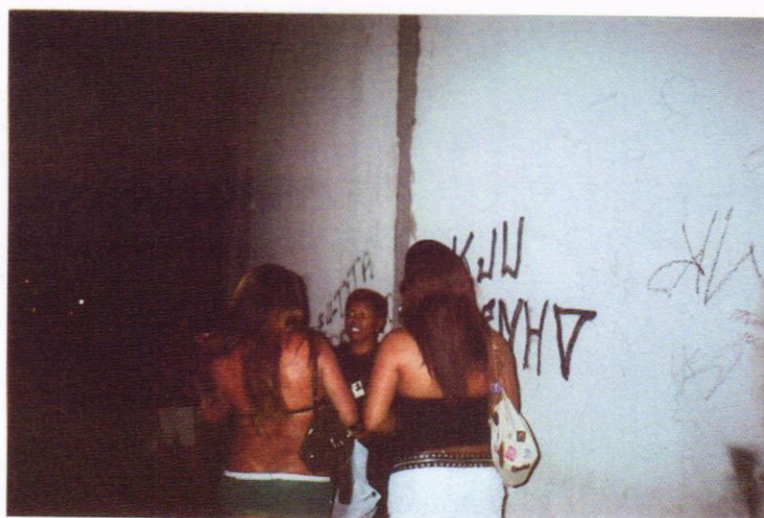
Fig. 3A - Prostitution Spot Transvestites