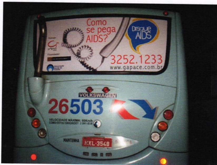
Fig. 6A – Bus-Outdoor