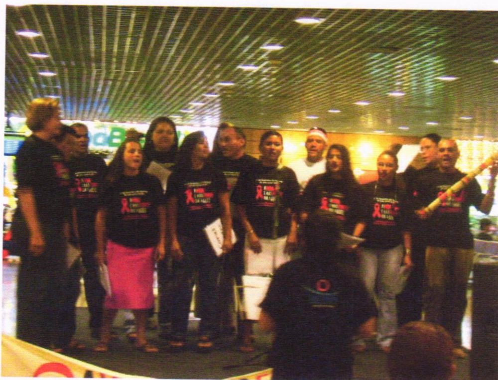
Figure 7 Solidarity Choir

Area: Life appraisal and Art therapy Project Objectives: Art Therapy activities for 80 people living with HIV/AIDS Institution: NAVE - Núcleo de Ação e Valorização da Espécie Humana Project Coordinator: Helena Damasceno