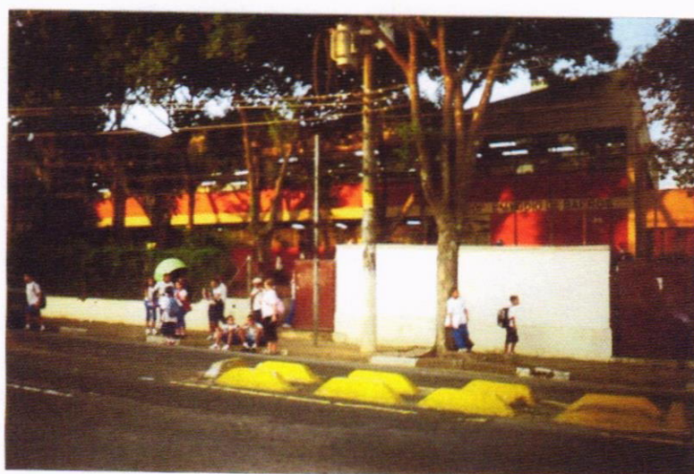
Fig. 3B - "Crack land", São Paulo

Figure 3 Areas of Action of the project: Fig. 3A – Prostitution Spot of Transvestites; Fig. 3B – "Crack land", São Paulo