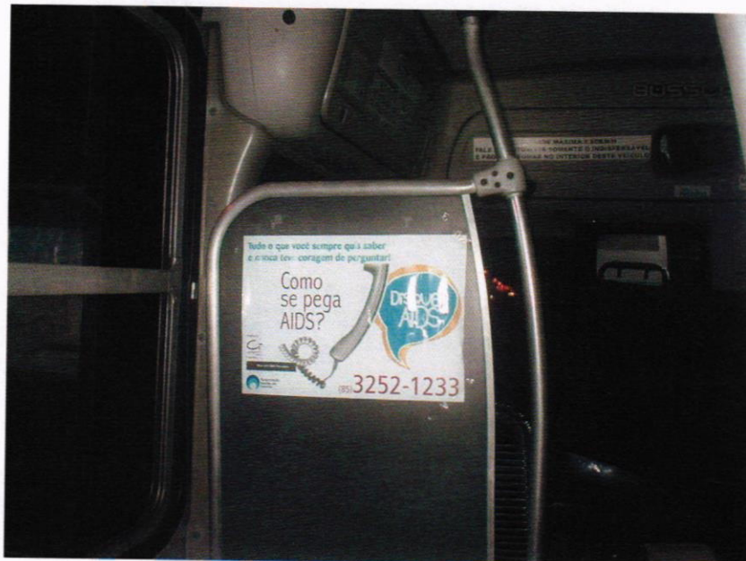
Fig. 6B – Bus-Outdoor